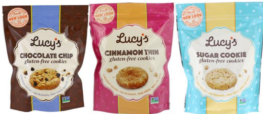
Lucy's Gluten Free Cookies

Varieties: Chocolate Chip, Cinnamon Thin, Sugar Cookie