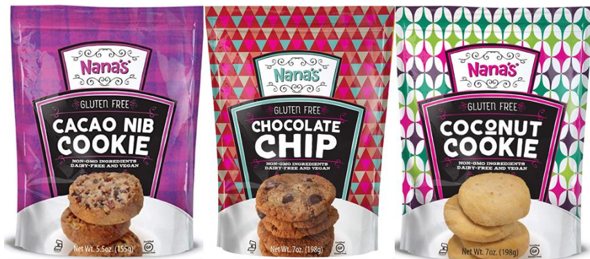
Nana's Gluten Free Cookies

NO high fructose corn syrup, synthetic sugars, preservatives, hydrogenated oil, or artificial flavouring