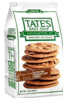
Tate's Bake Shop Gluten Free Chocolate Chip Cookies

Ingredients: Semi-Sweet Chocolate Chips (Sugar, Chocolate Liquor, Cocoa Butter, Milk Fat, Soy Lecithin [An Emulsifier], Vanilla, Natural Flavor), Rice Flour, Butter, Cane Sugar, Brown Cane Sugar, Eggs, Vanilla Extract, Baking Soda, Salt, And Xanthan Gum