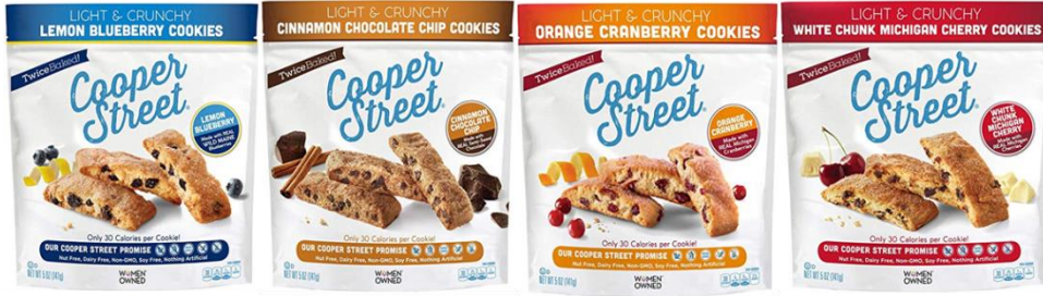
Copper Street Twice Baked Cookies

With only 30 calories & 2g of sugar in each cookie why not indulge?