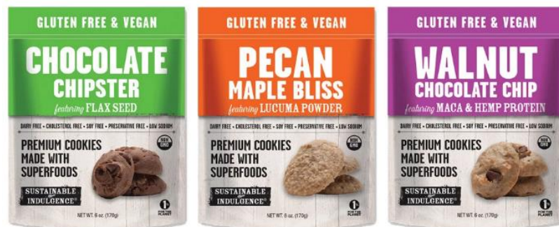
Sustainable Indulgence Premium Cookies

Ingredients for Cacao Nib Flavour: Gluten Free Flour Blend (White Rice Flour, Brown Rice Flour, Potato Starch, Tapioca Starch, Xanthan Gum), Palm Oil, Cacao Nibs, Organic Cane Sugar, Evaporated Cane Invert Syrup, Pure Vanilla Powder (Dextrose, Extractives of Vanilla Beans), Baking Powder (Calcium Phosphate, Sodium Bicarbonate, Rice Flour), Baking Soda (Sodium Bicarbonate).