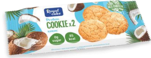
Royal Cake Low-Calorie High Protein Cookie

Ingredients for Lemon Blueberry Flavour: Unbleached Flour (Wheat Flour, Malted Barley), Pure Cane Sugar, Whole Eggs, Organic Non-GMO Canola Oil, Dried Whole Blueberries (Blueberries, Cane Sugar, Sunflower Oil), Cranberries (Cranberries, Cane Sugar, Grape and Blueberry Juice, Sunflower Oil), Non-GMO Dairy Free White Chips (Sugar, Sustainably Sourced Palm Kernel and Palm Oil, Natural Flavour, Sunflower Lecithin, Salt), Natural Blueberry Flavour, Natural Lemon Flavour, Natural Blueberry Powder, Aluminum Free Baking Powder (Sodium Acid Pyrophosphate, Baking Soda, Corn Starch, Monocalcium Phosphate).